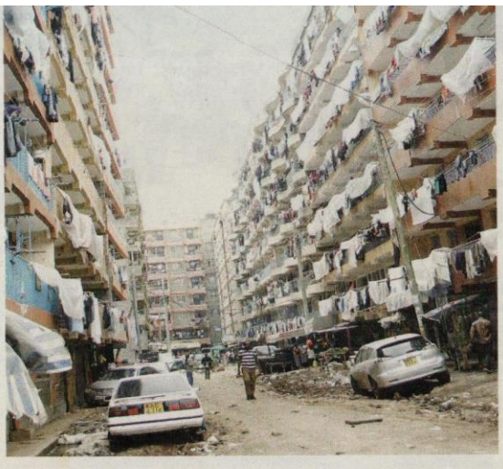
Some of the apartments in Pipeline estate. Most high-rise buildings have network problems. [File, Standard]

"I used to live in a single-room house—the network there was not good at all. Then I moved to another house one floor up and I have not experienced a problem since." Some time ago, Vinay Subbaramaia ha, who lives along Langata Road, wrote a complaint to Airtel Kenya. "A serious complaint to make against network and coverage provided. I live near Southern Bypass off Langata Road and surrounded by hundreds of Asian community households. Airtel network "I used to live in a single-room house